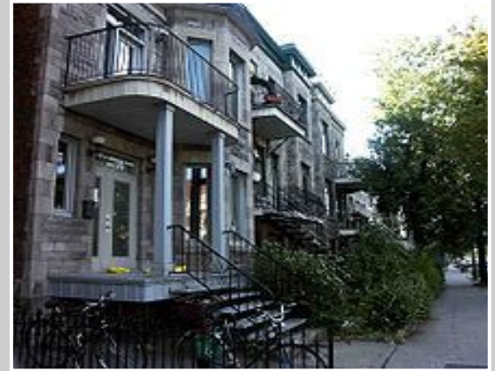
row apartments like a "slice in a long white cake of apartment-houses" (Fitzgerald ch. 2; 28).